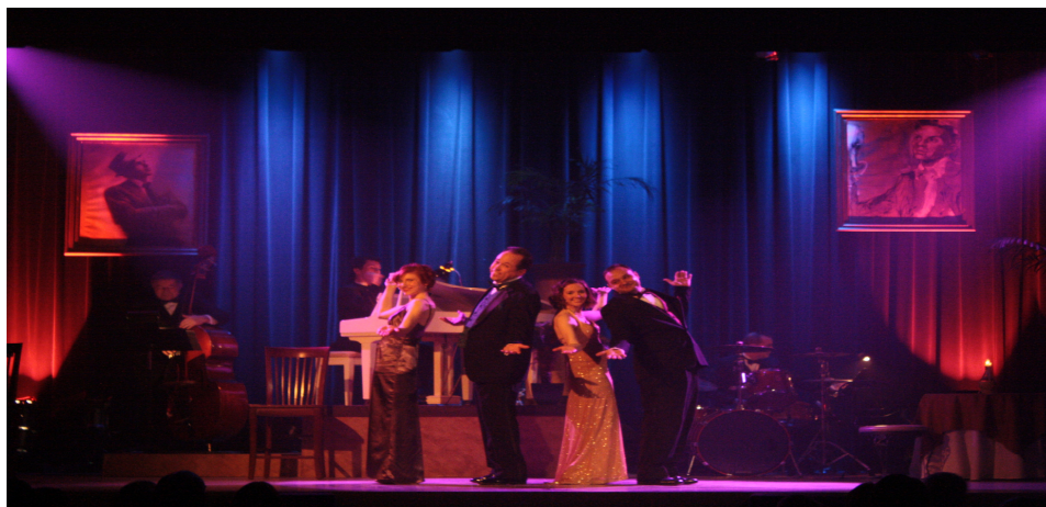
MY WAY, 2011