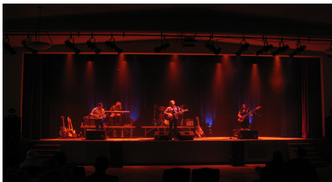
ROCK CONCERT, 2010

The cost for this installation, and the Campaign goal, is $15,000. All additional funds raised will be used to install acoustical tiles in The Oxford as the final step in completing the sound system enhancement. We appreciate your support for this project as we strive to bring the best performance experiences to all of our patrons, volunteers, students and performers. We look forward to seeing you soon at The Oxford!