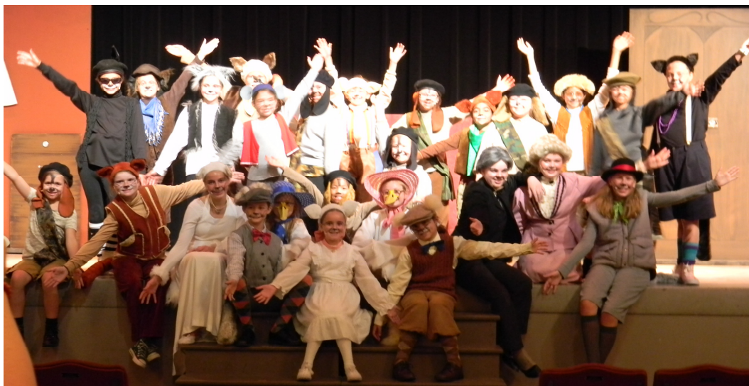
THE ARISTOCATS, 2012