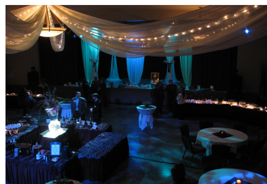
UNITED WAY EVENT, 2011

When The Oxford opened in 2010 we were able to secure grant dollars and donations to purchase a sound board for the space. This year's Legacy Campaign focuses on completing the sound system in The Oxford with the installation of a speaker system designed for the space that will enhance the sound quality for our patrons and give our young performers more sound support during their performances. Installing a permanent speaker system will provide better sound coverage in the room and decrease wear and tear on the current speakers that must be transported back and forth between shows at The Oxford & the State Theatre. The new speaker system will be more versatile, allowing for better sound reinforcement for the increasingly wide variety of performances that have been coming to The Oxford.